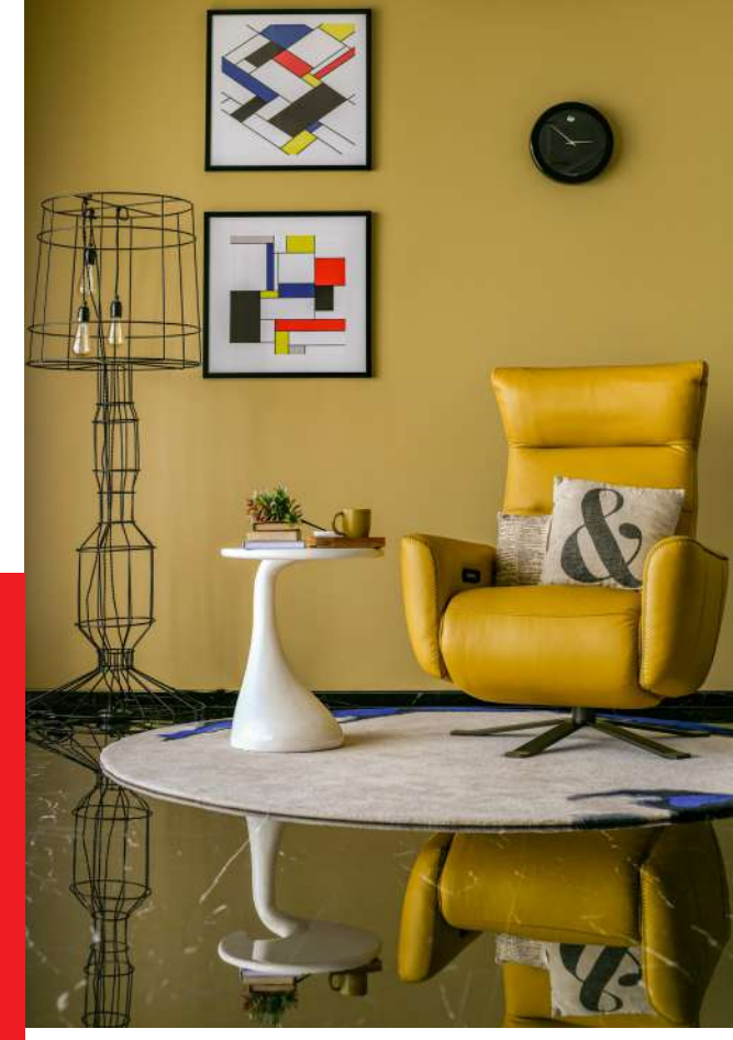
Use a virant color palette to brighten up your space